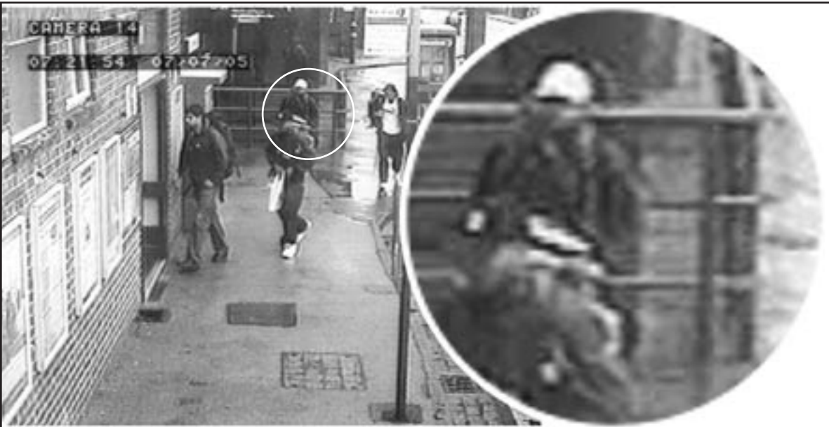
The inset shows a blowup of problems with the figure in the white cap. The railing behind the man appears to go in front of his arm, and another rail appears to continue across his face.