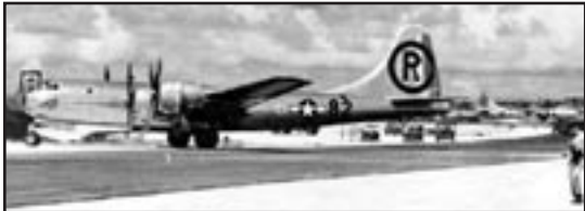
The Enola Gay dropped the bomb.