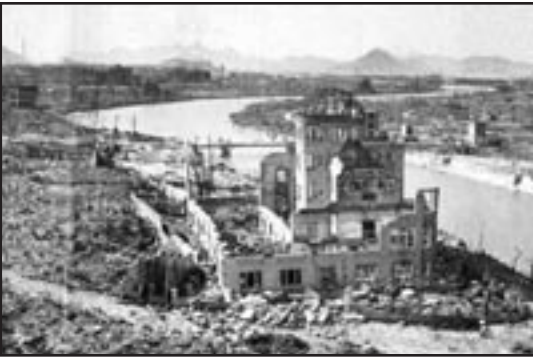
A devastated landscape. Most structures were made of wood, all incinerated in the blast.