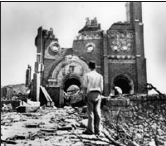
St. Mary’s Cathedral, also known as Urakami Cathedral was destroyed in the blast.