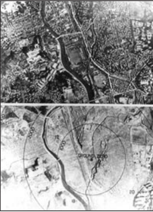
Aerial photos of Nagasaki before and after the blast.