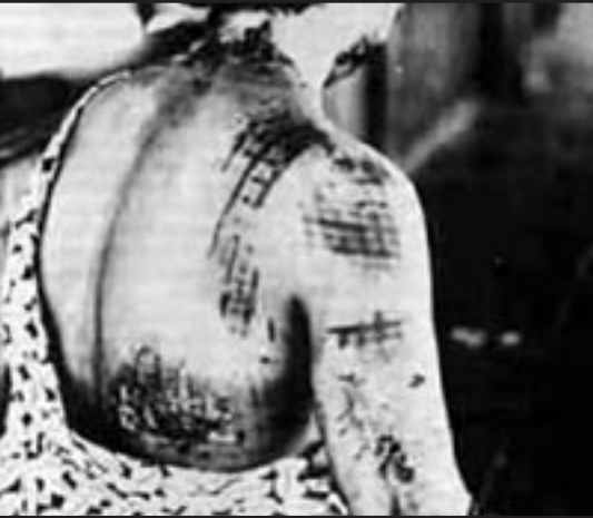
Radiation caused burns, here a woman is burned in the pattern of the kimono she was wearing at the time of the blast.