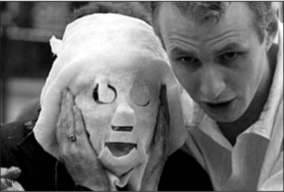
July 7, 2005: The haunting image of a burn victim being guided to safety.

By MATT SULLIVAN / RCFP After four years, rumors swell in London that the British Government had a hand in the terrorist attacks of 7/7. Three Tube stations and a bus were struck with bombs that morning. The government’s official story, that the attacks were staged by four British Muslims, inspired by al Qaeda but unaffiliated with any specific group is being rejected by growing numbers of Brits.