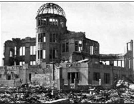
The Atomic Dome, at ground zero in Hiroshima, is now a peace memorial and place of pilgrimage.