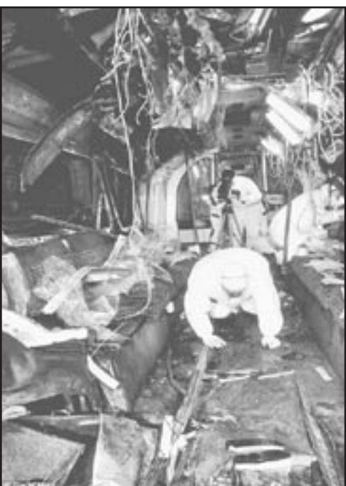
Recently released photo of train damage shows floor blown upwards (lower left) as reported by numerous witnesses.

eyewitnesses who remember four men running between stations at triple speed and carrying large heavy backpacks. Another problem with the revised timeline is that it is contradicted by an already released security camera frame which purports to show the bombers entering the Luton station at 7: 22, which would give them only three minutes to walk up the stairs at Luton, buy their £22 round-trip tickets and get to the platform, which was already packed with commuters because of the earlier travel disruptions. This still CCTV photo of the four bombers arriving at the station in Luton is the only one of the four men together on July 7. But this officially released still has serious problems. It appears to be a fake, and a crudely done one at that. Another problem for the official story is that there are no eyewitnesses