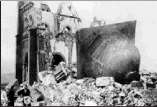
The toppled cathedral dome.