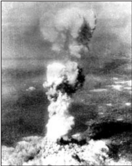
The atomic mushroom cloud over Hiroshima.