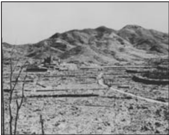
A devastated landscape. The ruins of St. Marys Cathedral can be seen in the distance.