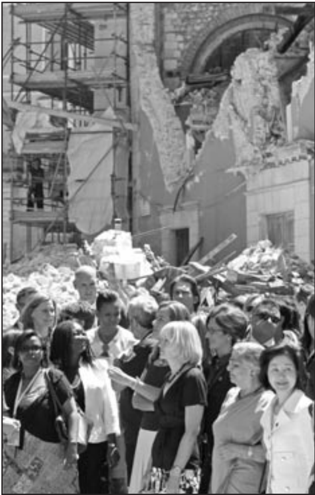
G8 First Ladies use L’Aquila disaster as back drop for photo op.

The central focus of the citizens committees is the 100% Campaign, which calls for 100% reconstruction of the city, 100% participation on the part of the local residents in the decisions that affect the city, 100% transparency regarding how reconstruction money is spent. The funds thus far authorized by the Italian government are deemed to be insufficient to rebuild the city. If compared to the 1997 earthquake in Umbria, with more than twice the number of people left homeless in L’Aquila, the government has authorized 20% less for the reconstruction of