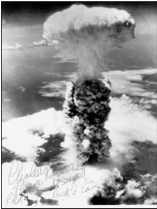
The atomic mushroom cloud over Nagasaki, photo signed by the pilot.