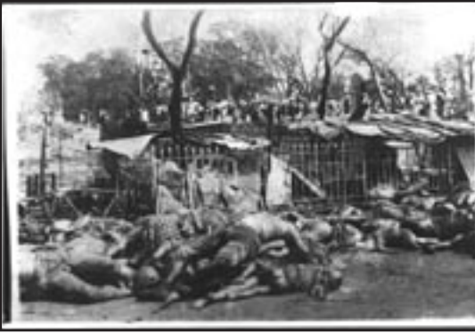
Stunned survivors stream past the dead in the immediate aftermath. Most would soon succumb to radiation sickness.