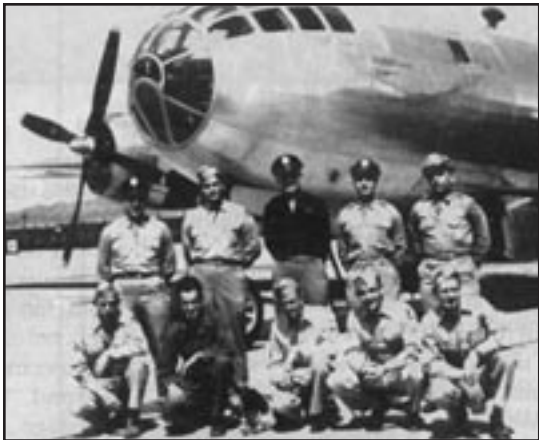
The crew of USAF B-29 Bock’s Car.