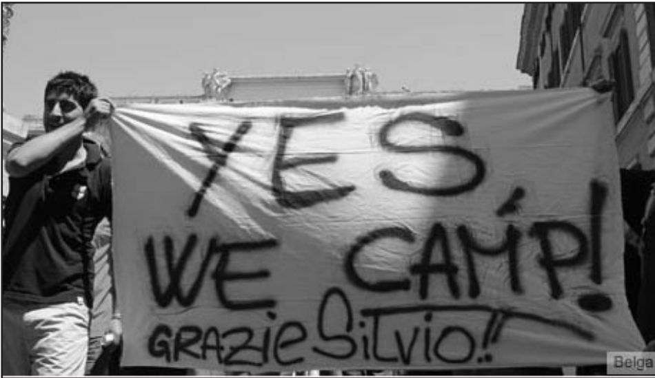
23,000 of the 70,000 residents of L’Aquila remain in the city, nearly all of them living in tent camps.

Unlike most Italian marches, there were no signs, flags or banners, aside from one with the